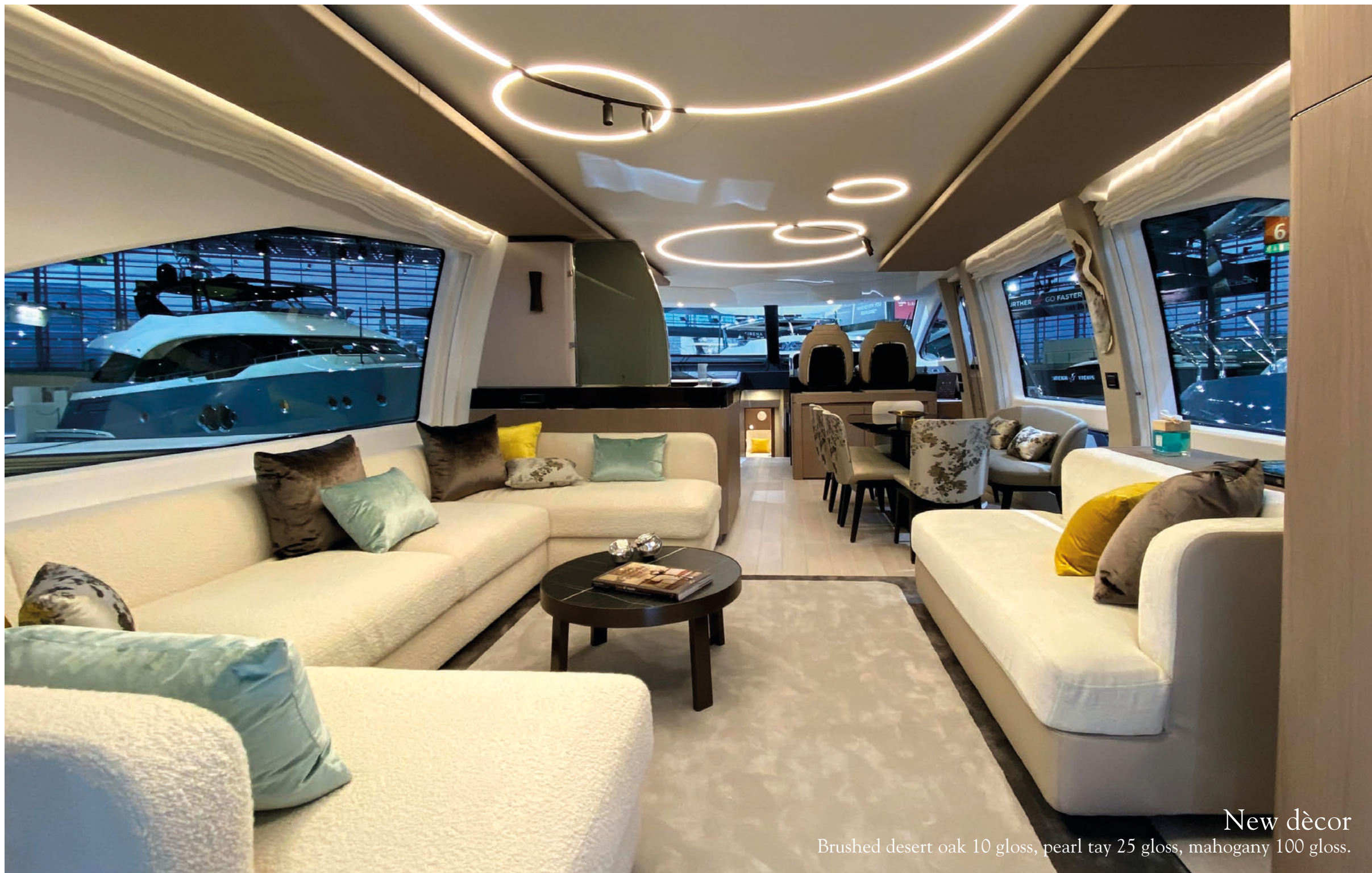
New décor Brushed desert oak 10 gloss, pearl tay 25 gloss, mahogany 100 gloss.