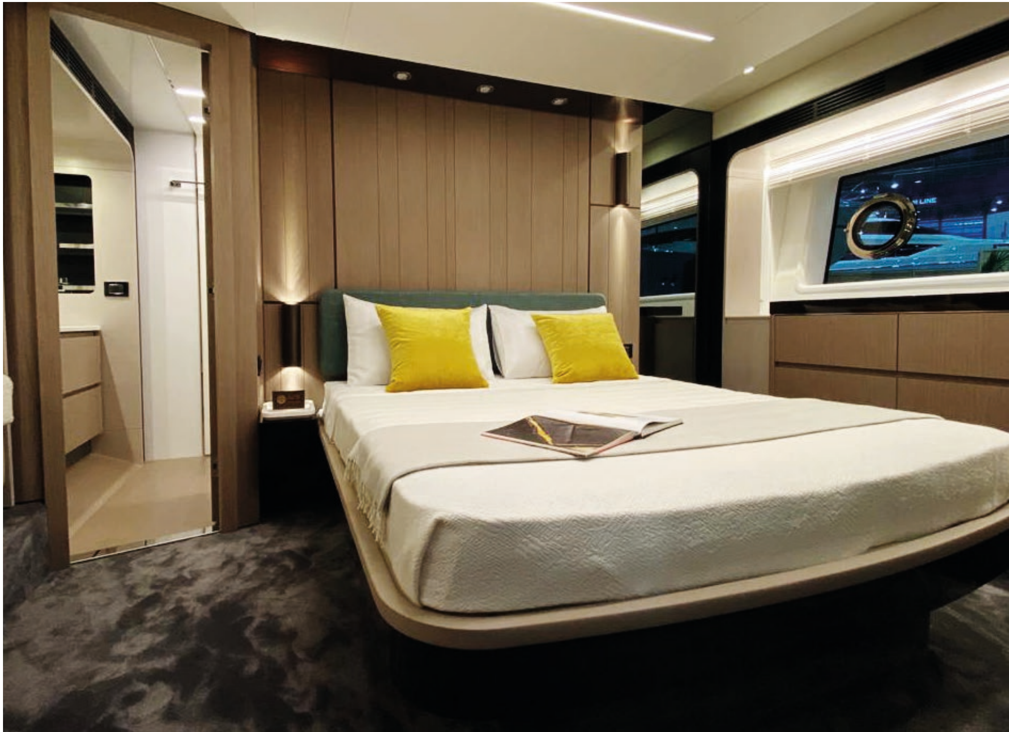
Brushed desert oak 10 gloss, pearl tay 25 gloss, mahogany 100 gloss.