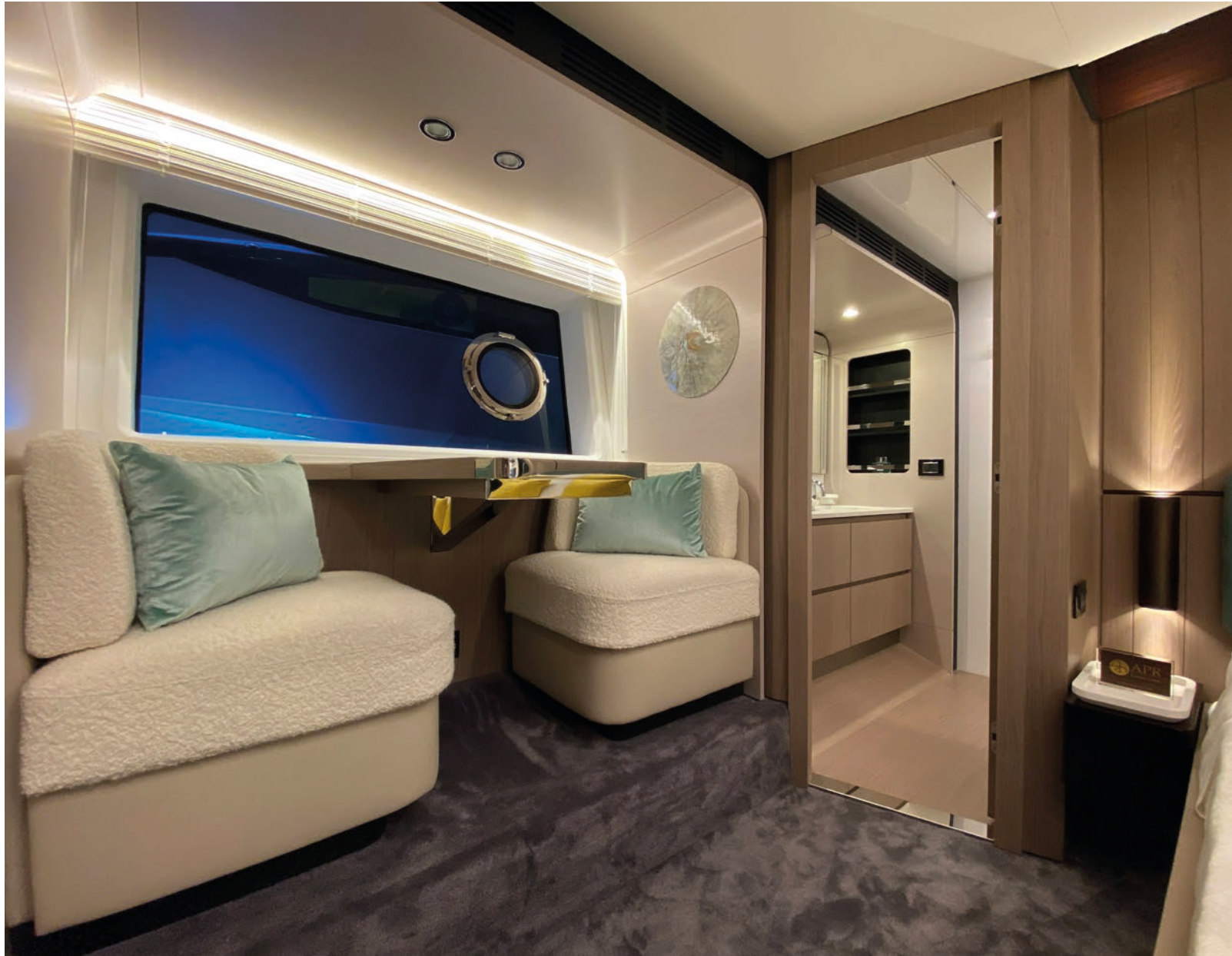
Brushed desert oak 10 gloss, pearl taw 25 gloss, mahogany 100 gloss.